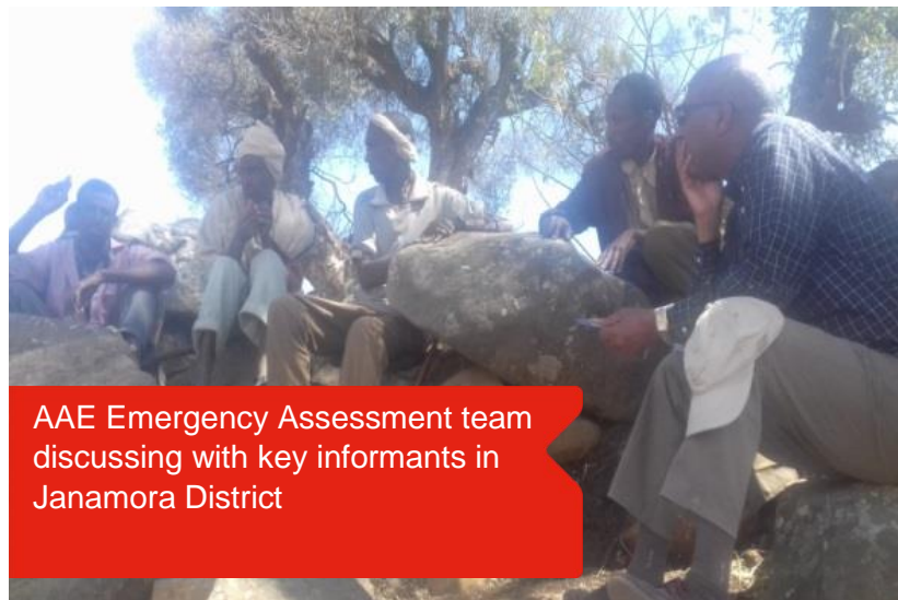
AAE Emergency Assessment team discussing with key informants in Janamora District

Learning is being used for emergency assessment approaches, particularly in response to El Niño, to ensure the response builds on existing resilience and contributes to it by integrating long term resilience interventions. Given the frequency and impact of droughts, AA Ethiopia focuses on early warning systems, compiling and sharing bi-monthly early warning reports. 57 The resilience team is also increasingly coordinating its work with other teams in Ethiopia in order to promote integrated resilience programming.